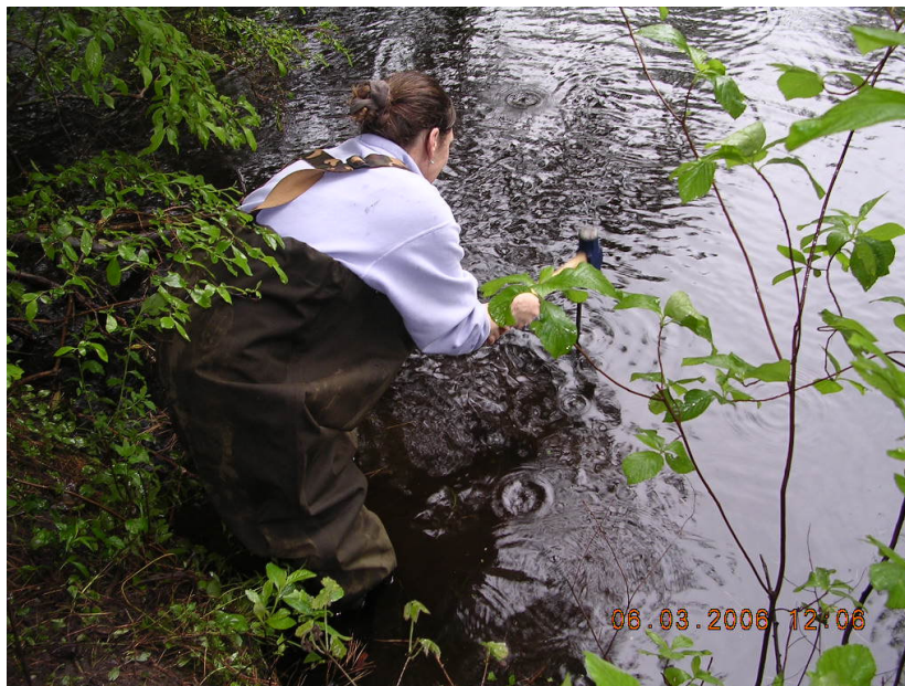
Figure 1: Installment of biofilm devices.

In lotic environments metabolic activities of microorganisms have been found to have a large effect on the systems chemistry and are important in the degradation of terrestrial inputs and environmental contaminants (Hullar et al., 2006). In nature, microorganisms often exist in complex communities associated with surfaces called biofilms. Biofilms are made up of extracellular substances synthesized and excreted by bacterial cells (Donlan et al., 2004), and are important components of aquatic ecosystems. This research will assess the effects of a variety of environmental contaminants on biofilm production by comparing the chemical composition and microbial diversity of biofilms exposed to environmental contaminants to biofilms left in their natural state. The funds acquired through the Faculty Development Grant were used to purchase materials for the preliminary work necessary to start this research.