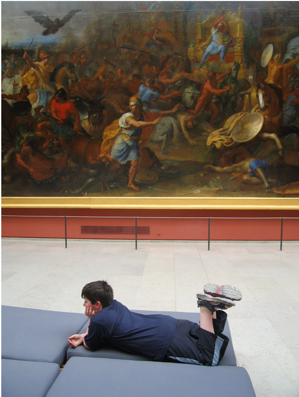
Tired of Battles. Musée du Louvre, Paris, France. Color Photograph.