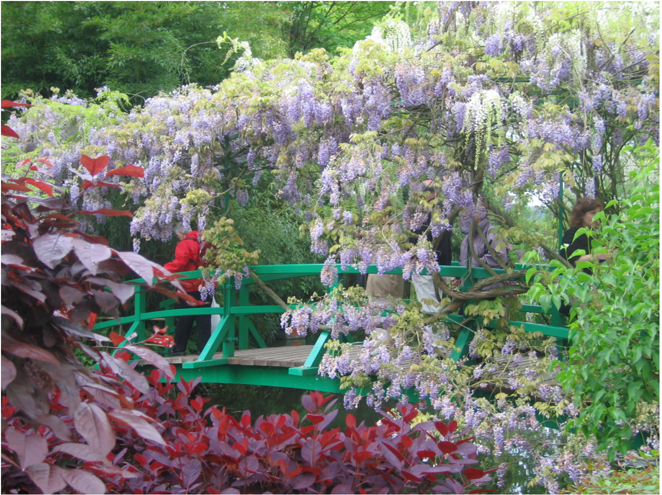
The Triumph of Spring in the Monet's Estate. Giverny, France. Color Photograph.