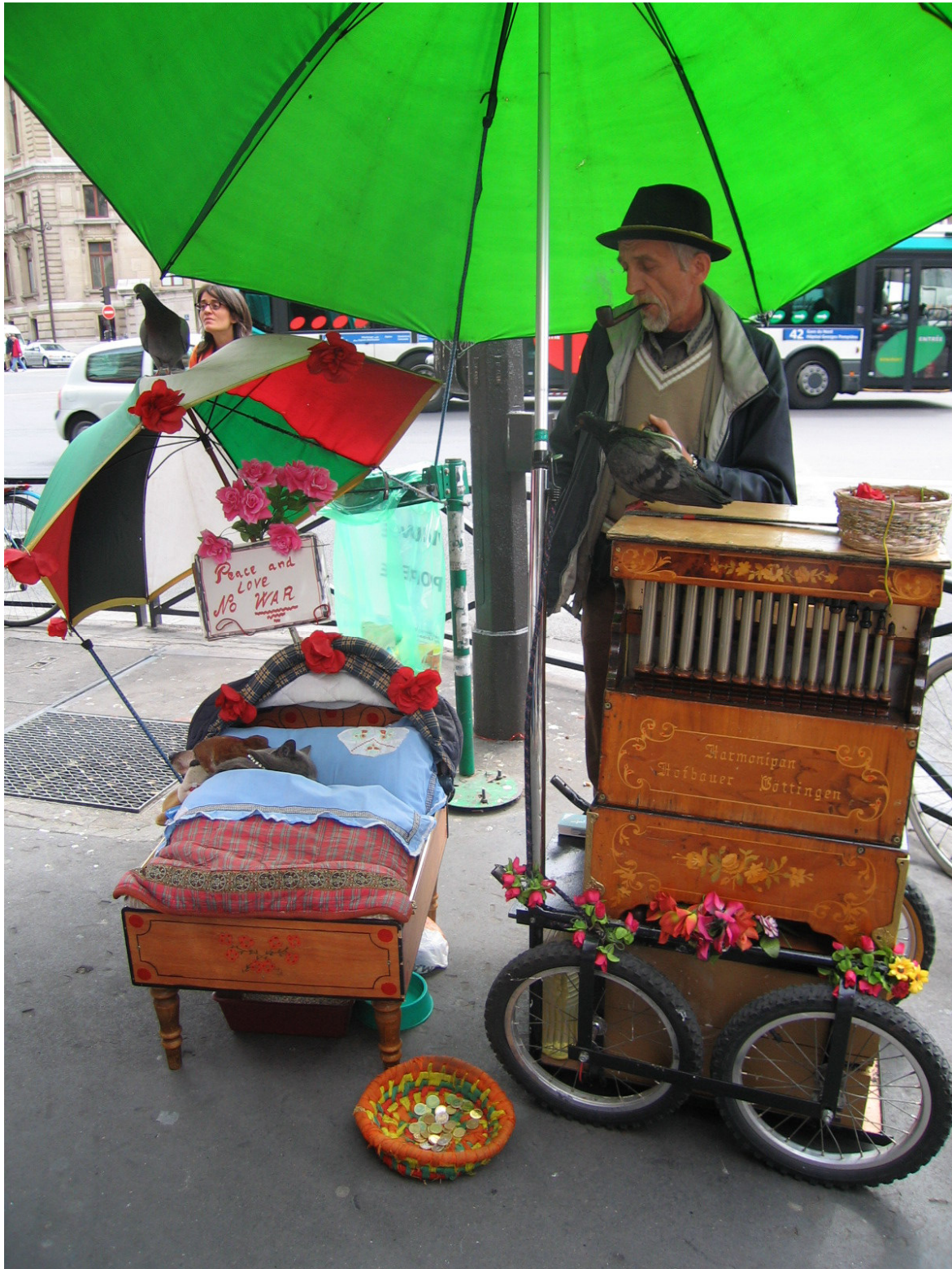
Street Organist. Paris, France. Color Photograph.