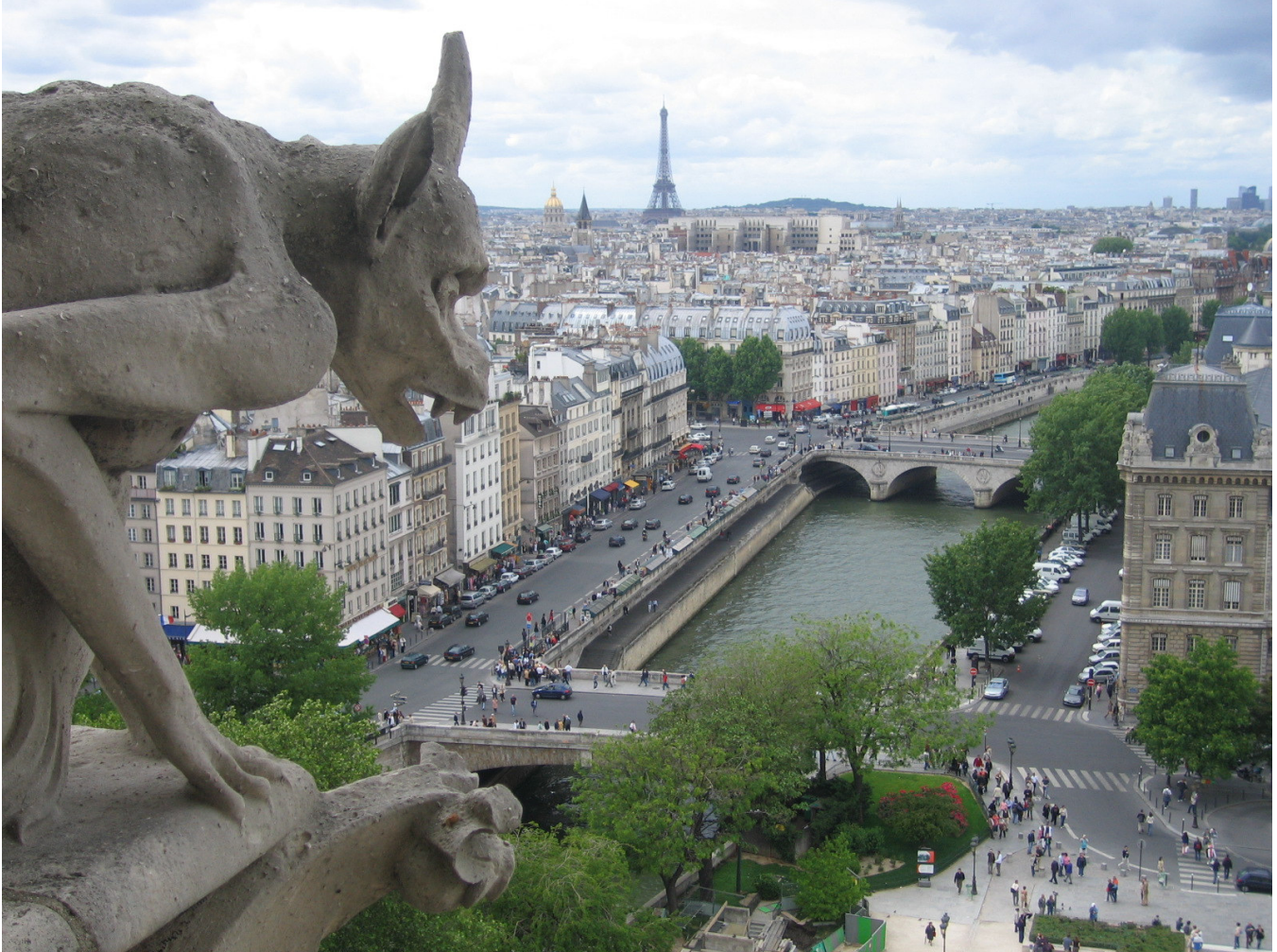
View from the top of the Notre-Dame Cathedral. Paris, France. Color Photograph.

“Last spring, I returned to France. Paris attracts me for its vibrant life, power of beauty, and the wealth of history and art. There is no better way to embrace Paris at a glance as from the top of the Notre-Dame Cathedral. After that you would want to immerse into its life walking along the Grand boulevards under the blooming chestnut trees, or just sipping a cup of coffee in a side-walk café, watching the crowd. The history will open up to you when you visit Panthéon or Musée du Louvre, and then experience the Monet’s enchanting beauty in Giverny. These pictures reflect my admiration of the City of Lights, its past and present.” – Vladimir Riabov