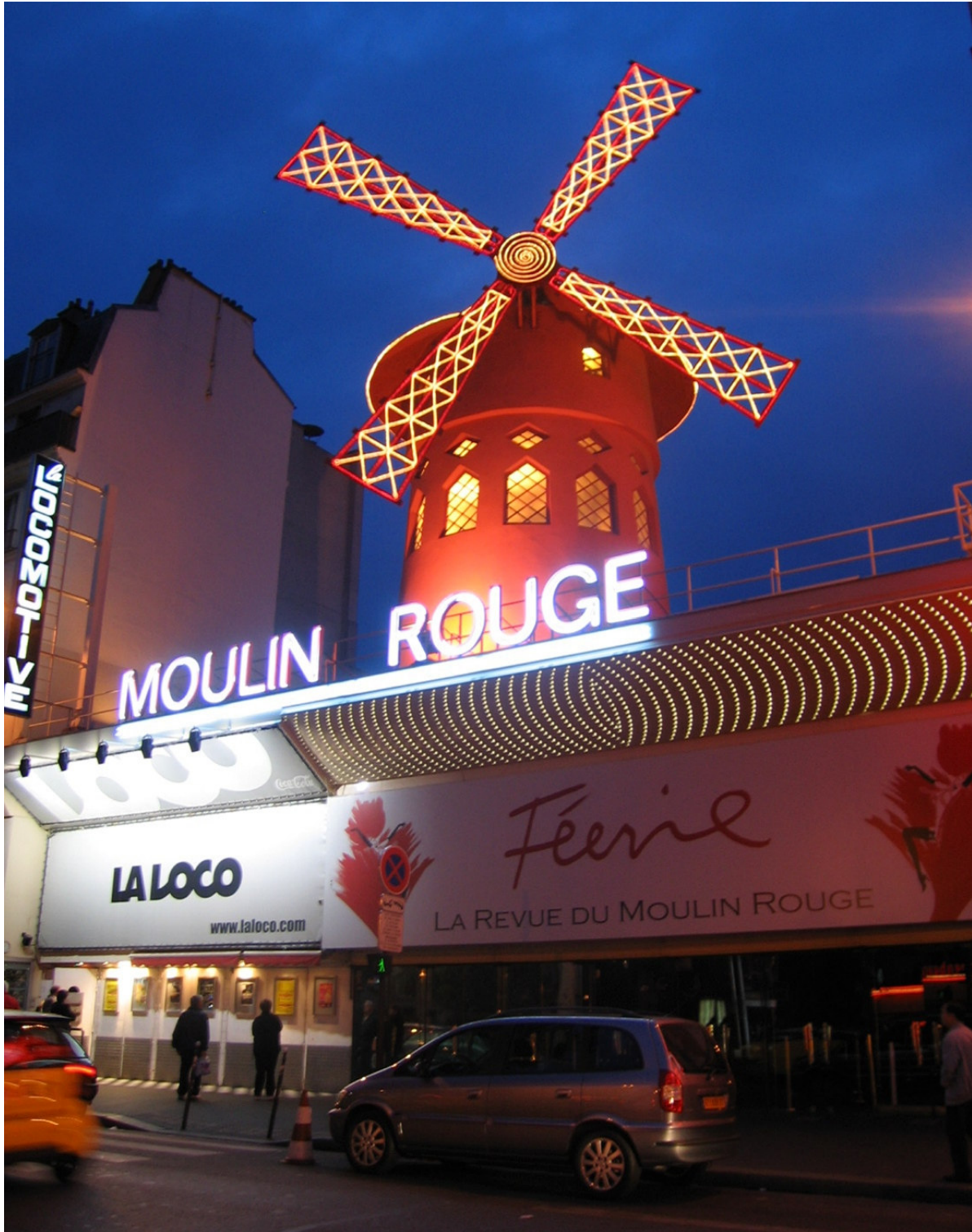
Moulin Rouge. Paris, France. Color Photograph.