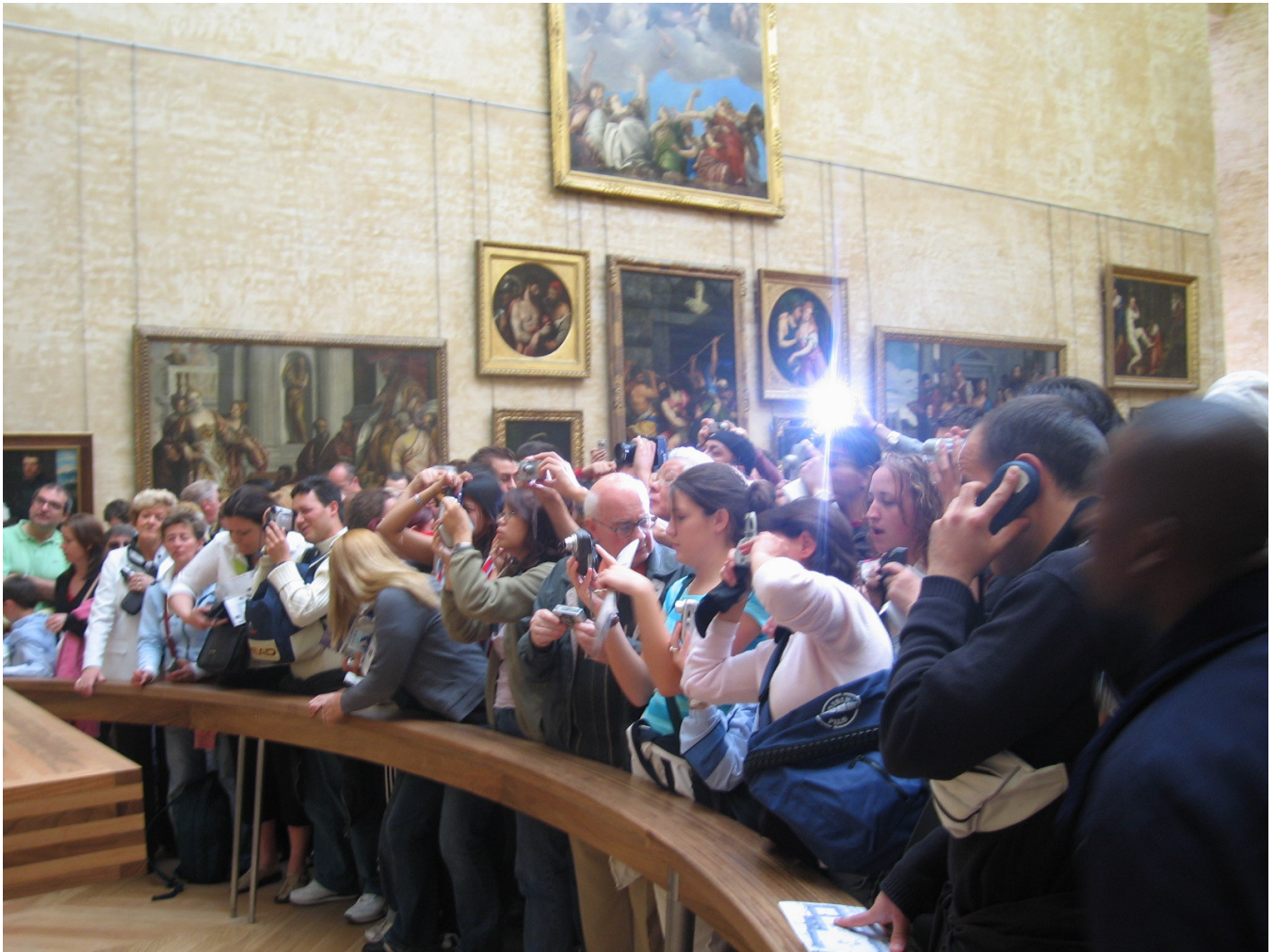
Admirers of La Gioconda (Mona Lisa). Musée du Louvre, Paris, France. Color Photograph.