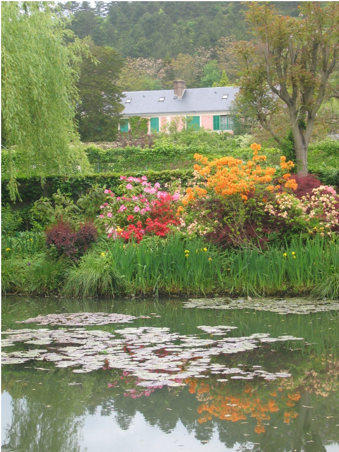
The Enchanting Beauty of the Monet's Water Lily Pond. Giverny, France. Color Photograph.