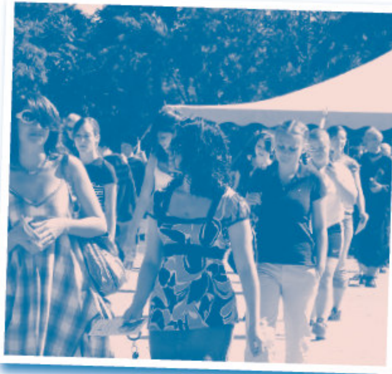
Students head to lunch after Convocation.

Jennifer J. Liskow '02G* (From: Campus Forum , September 14, 2007)