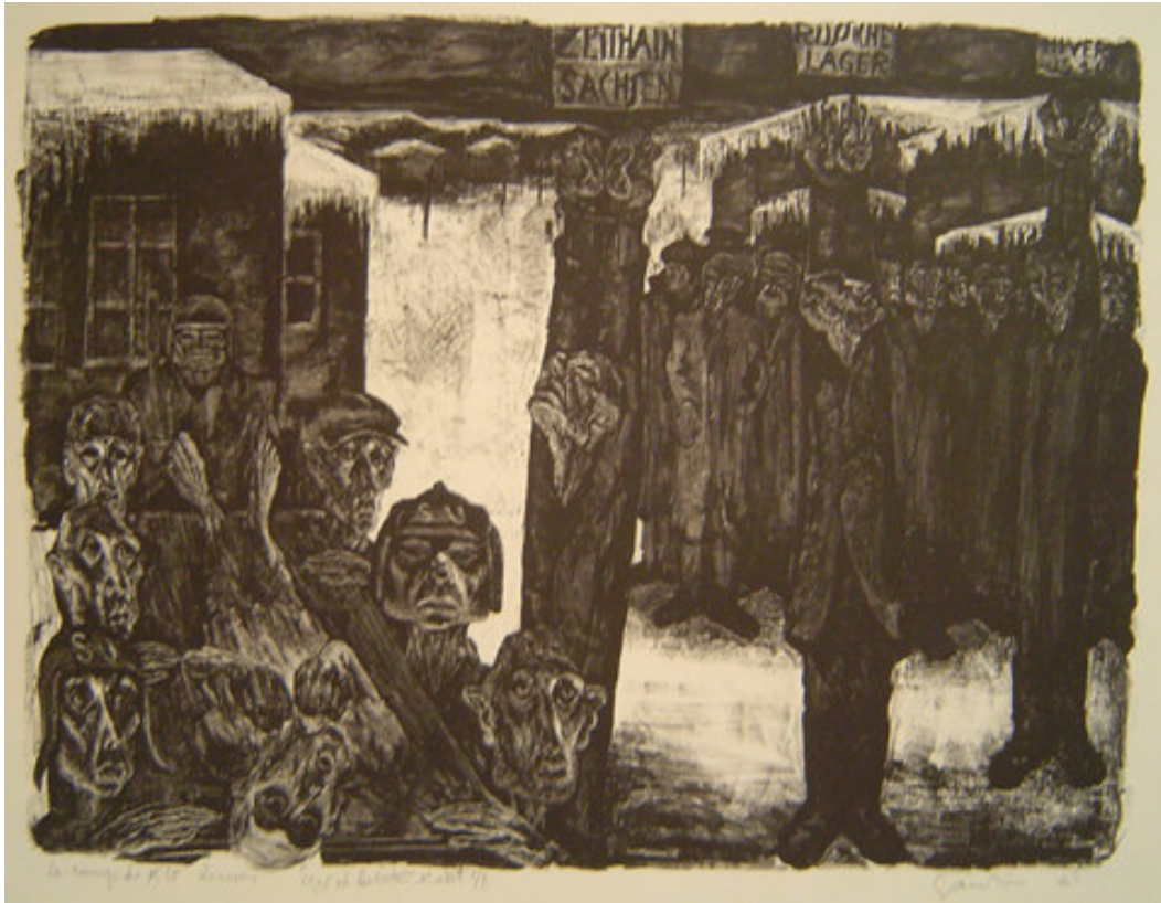
Auguste-Jean Gaudin (b. 1914) French Crucifixion/Russian Prison Camp 19 ¼" × 24 ½" Intaglio