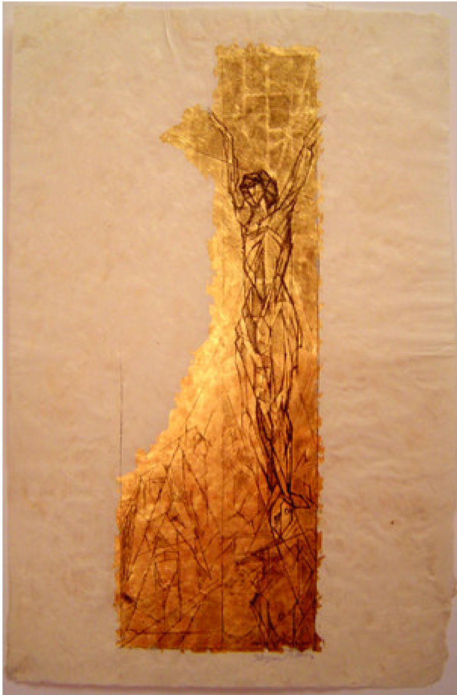
Jacques Villon (1875-1963) French Crucifixion 18" 1/4" × 16 1/4" Lithograph on gold leaf