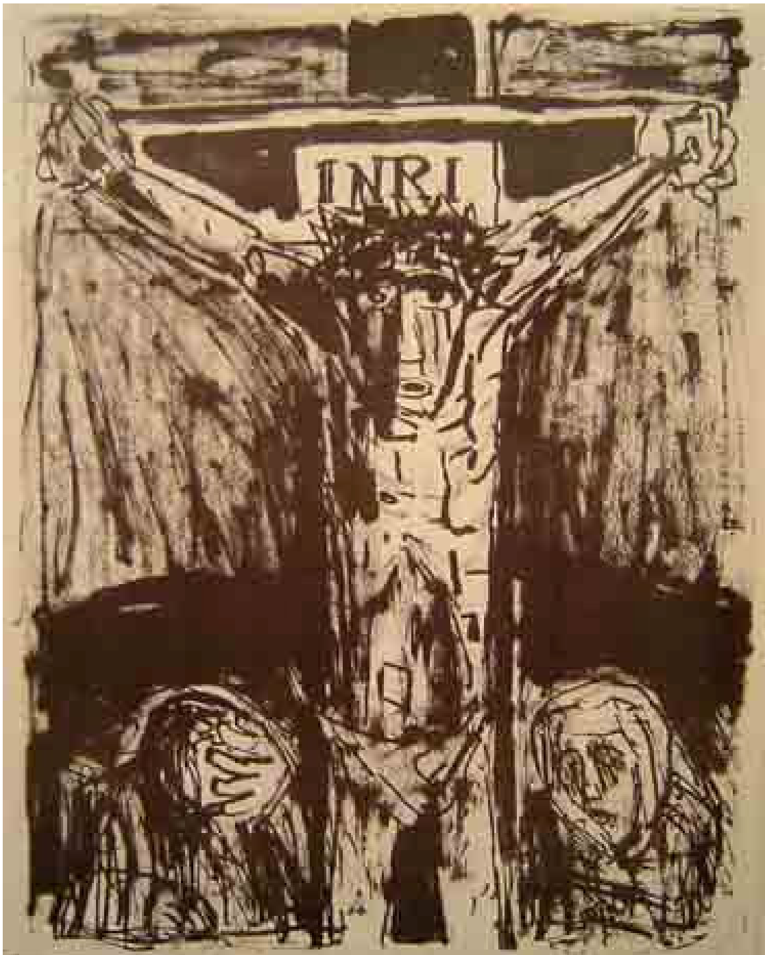
Otto Dix (1891-1969) German Crucifixion 11 ½" × 9" Lithograph