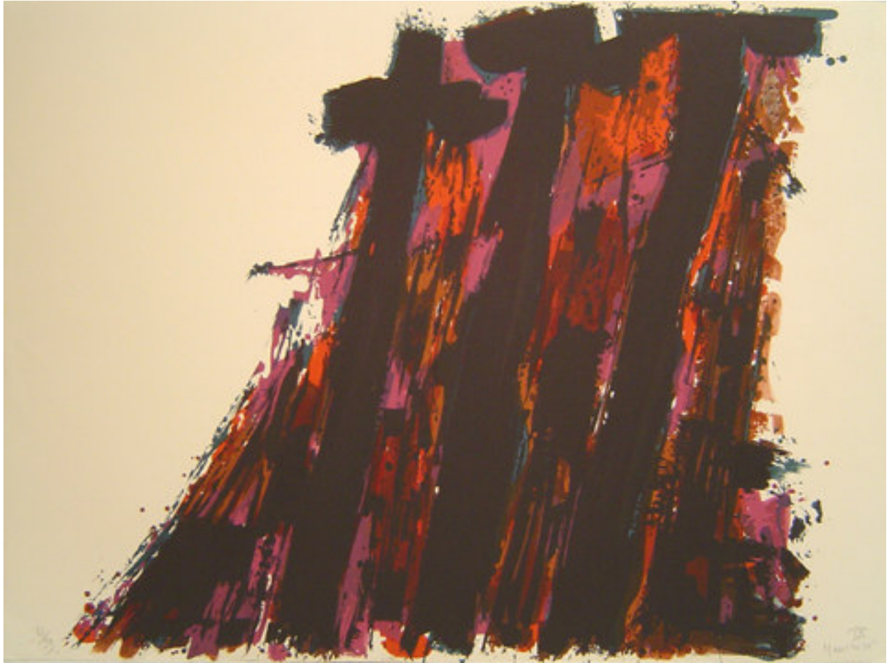
Alfred Manessier (1911-1993) French "IX" (Three Crosses) 22" x 30" Color lithograph