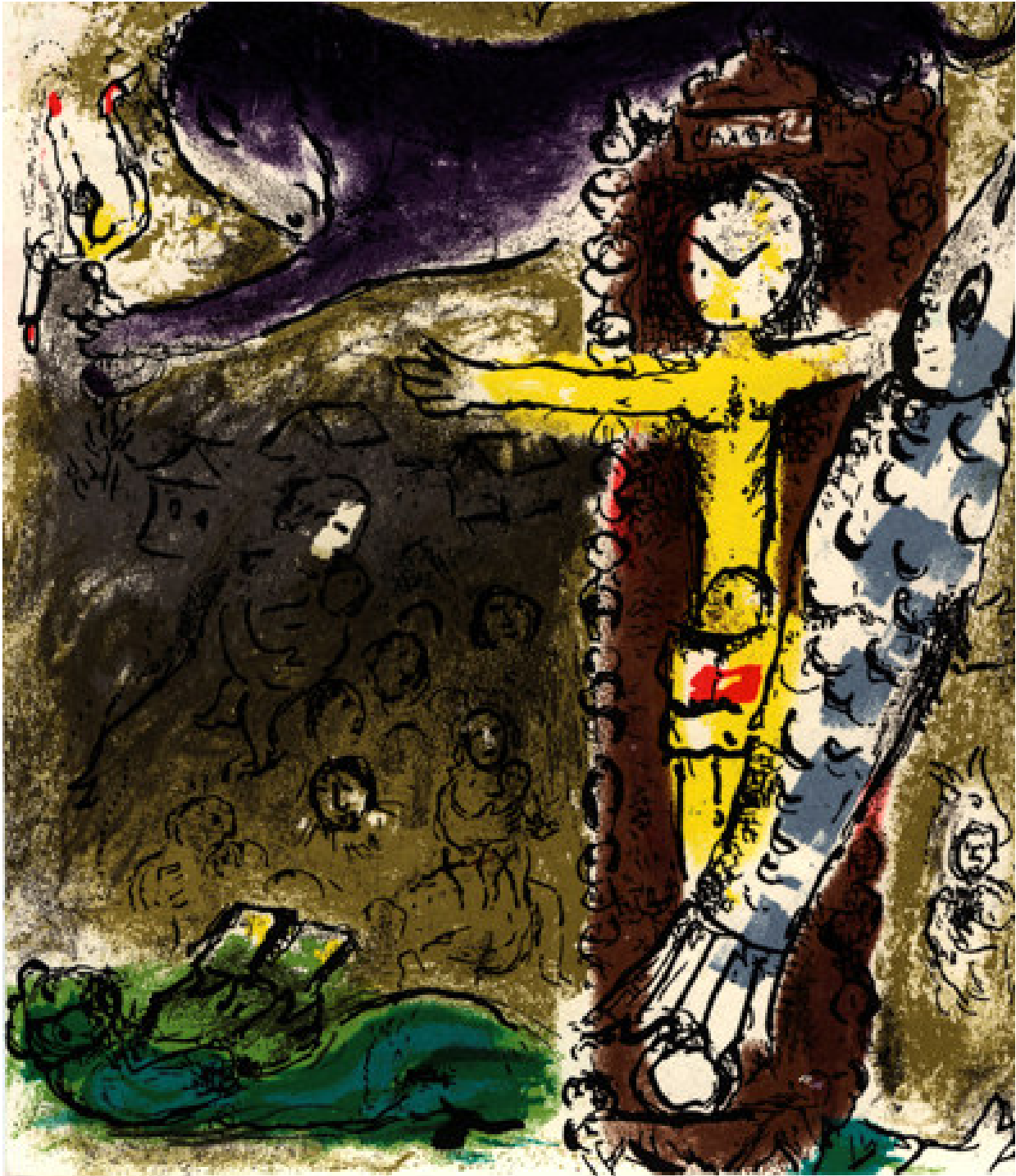
Marc Chagall (1887-1985) Russian/French Christ in the Clock 9" x 7 7/8" Lithograph