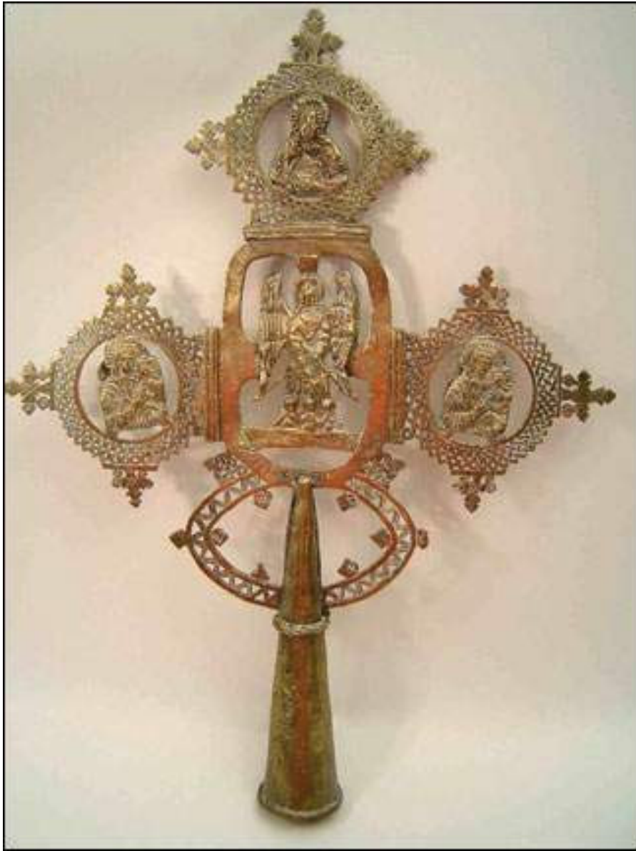
Ethiopian Processional Cross (19 th century) Bronze w/silver 24" x 18"