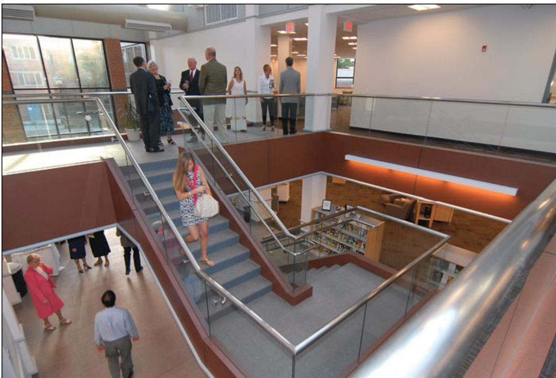
Guests at the library celebration take tours of the new space.