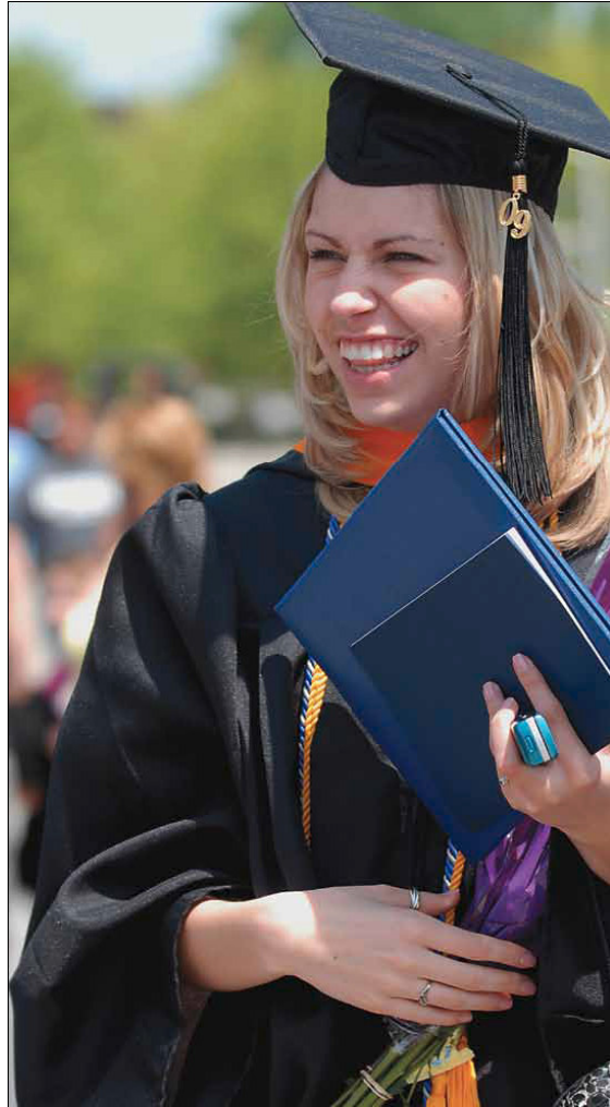
With her diploma, cell phone, and smile, this graduate is equipped to handle whatever comes next.