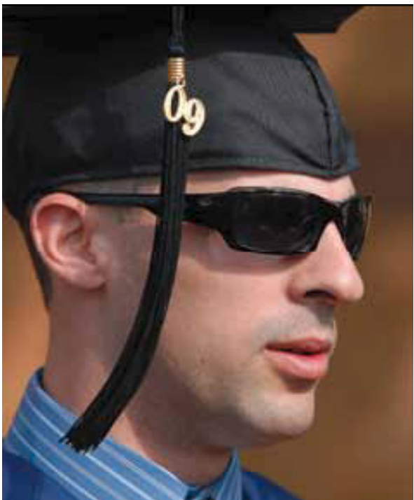
Above: Student stand outside Tsongas Arena waiting for the ceremony to start.