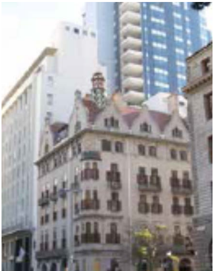
Wealth in Capetown—photo taken by Sister Theresa on her trip to South Africa