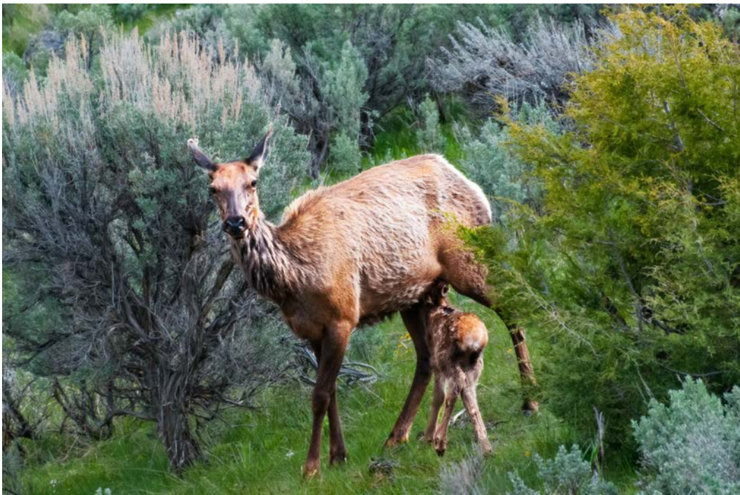
The joy of motherhood.

Whether you are a moose cow in Rocky Mountain National Park in the rain or an elk cow on a sunny day in Yellowstone National Park, motherhood means protecting and feeding your young.