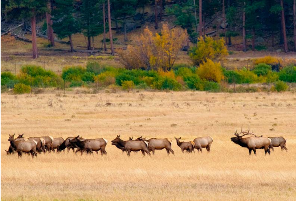
Dominant bull elk bugling his harem.

Young bull elk practice dueling for dominance in Rocky Mountain National Park.