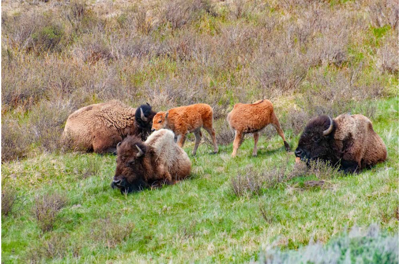
Bison cows and their calves.

It takes a village, and in this case a bison herd to raise their calves in the Yellowstone National Park.