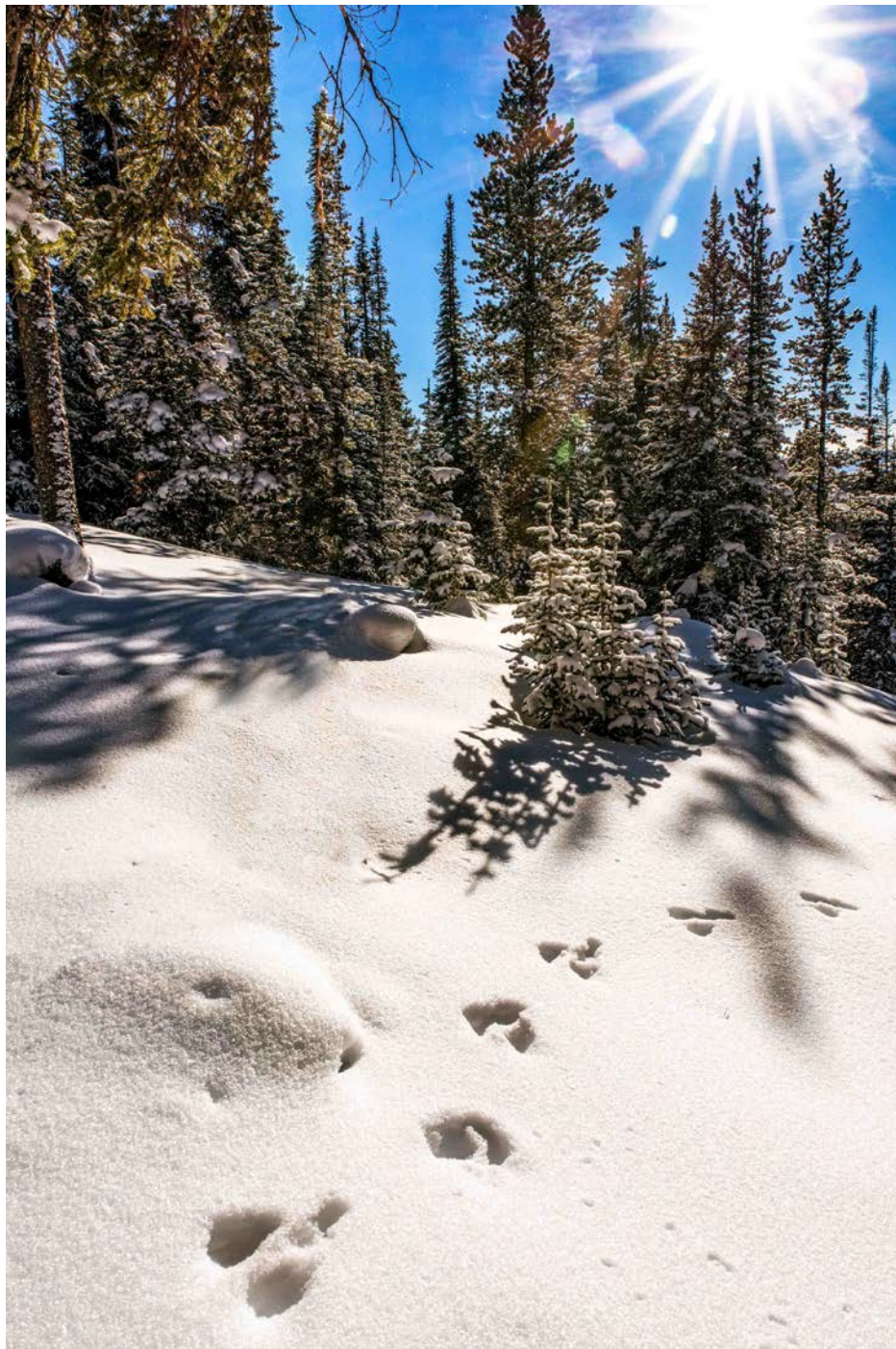
Life thrives all around us, if you only look close enough.

Winter can be brutally cold above 10,000 ft, with temperatures falling below -30° F in Colorado's White River National Forest, but if you look close enough, you can see tracks made by a snowshoe hare across the fresh fallen snow.