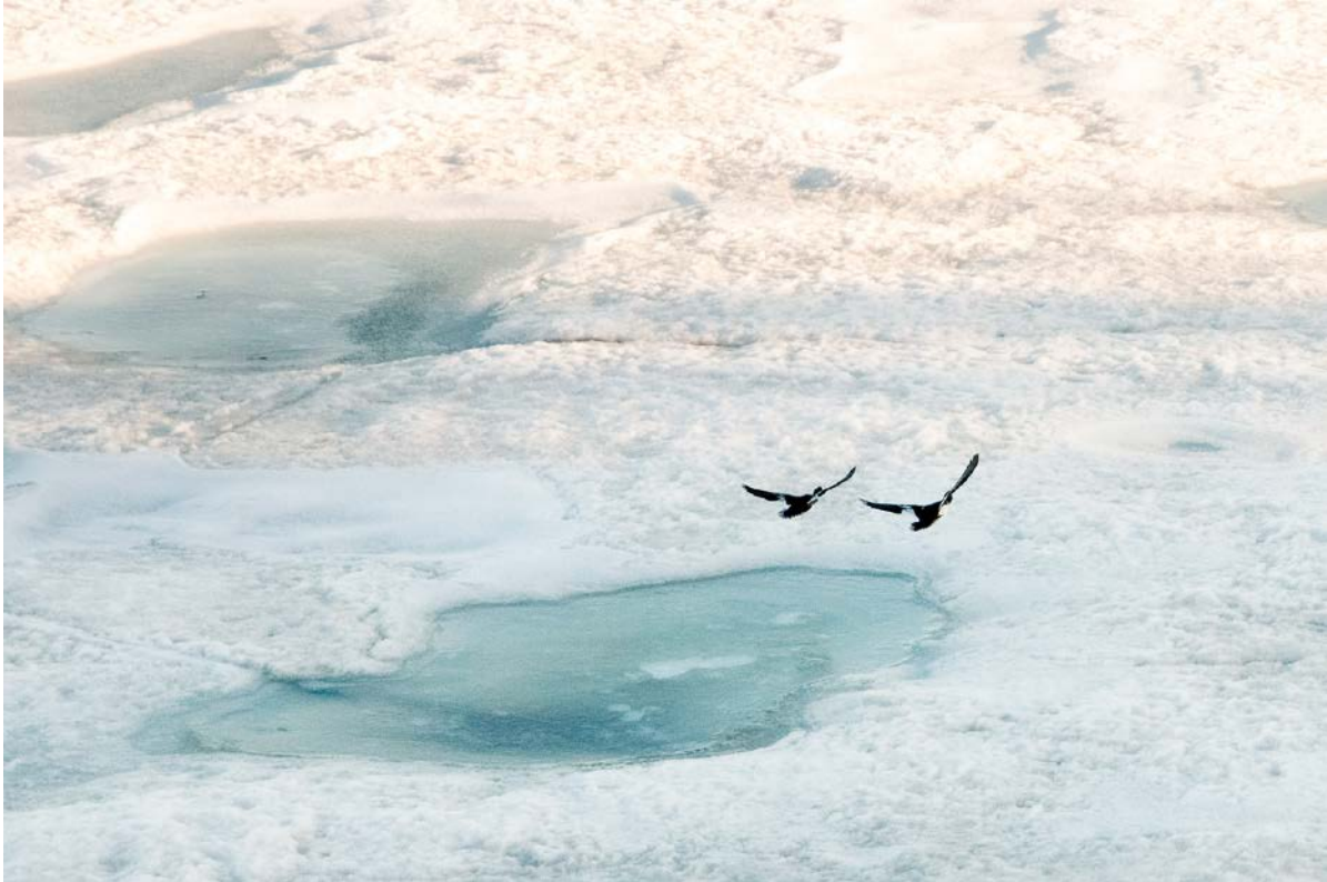
Flying over frozen Lake Yellowstone.