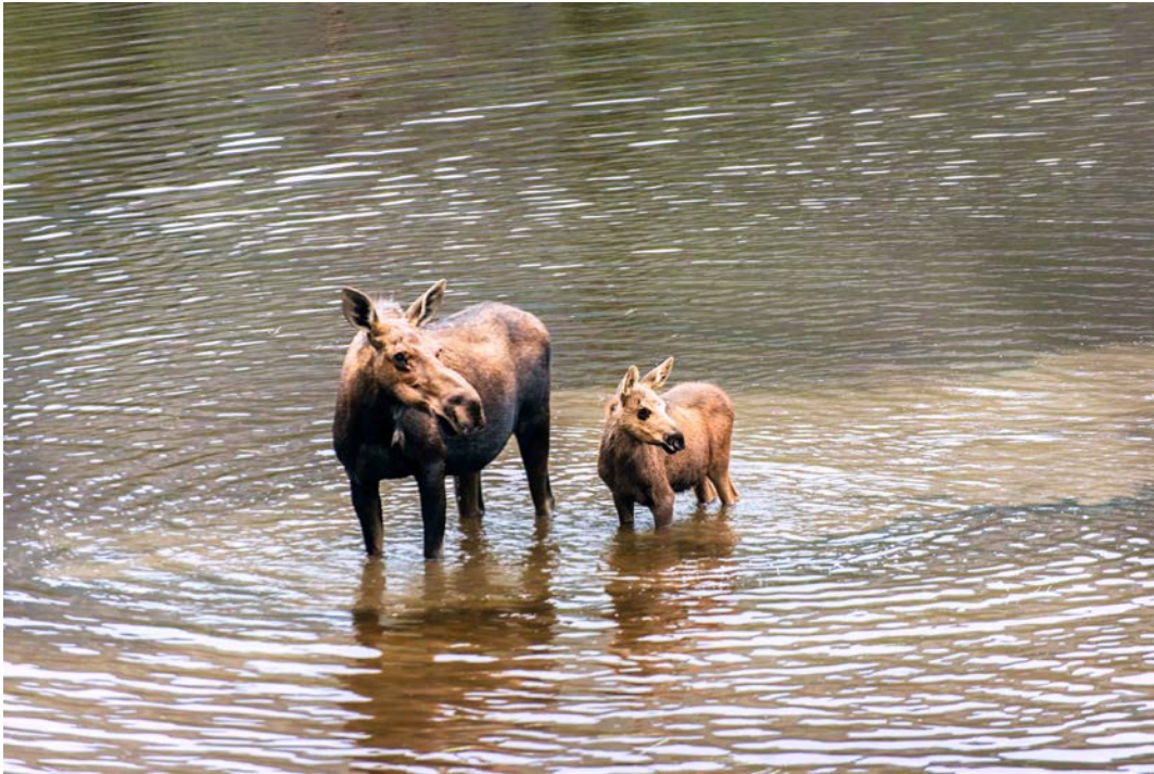
Moose cow and her calf.