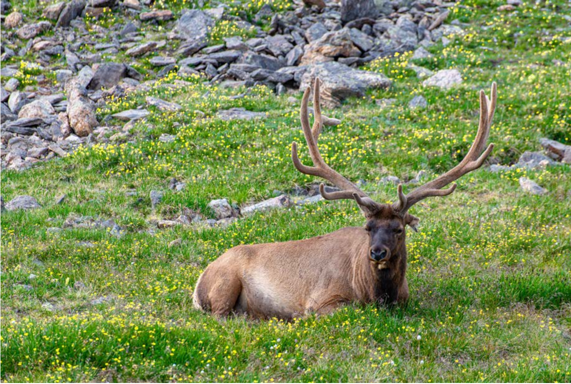
Resting bull elk.

Perhaps fatigued by a warm summer day, or by fighting off challengers, this mature elk gets his respite in a field of wild flowers in Rocky Mountain National Park ■