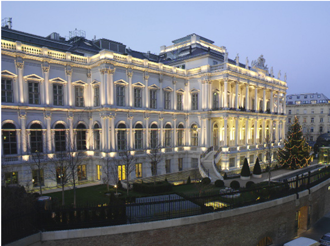
A former palace, the Residenz Palais Coburg is Vienna's most distinctive hotel.

Situated in the heart of Europe, Vienna has been shaped by a wide variety of cultural elements and has played a major role in world history. It is evident in the city's architecture and outstanding achievements. No matter where we traveled it seemed we were touched by its past. It is with New York and Geneva now the third home of the United Nations.