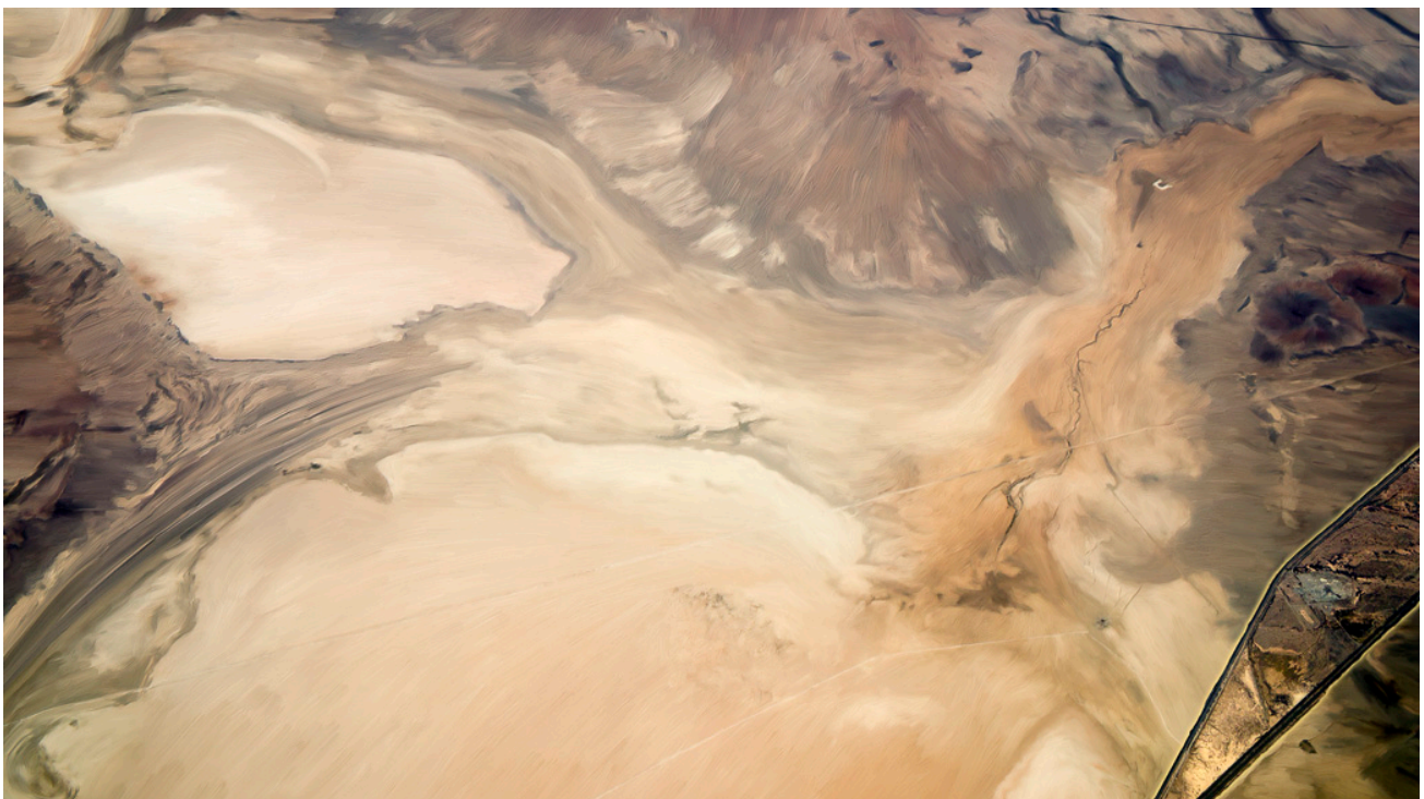
Primordial. Mixed Media Image © by Ronnie McClure