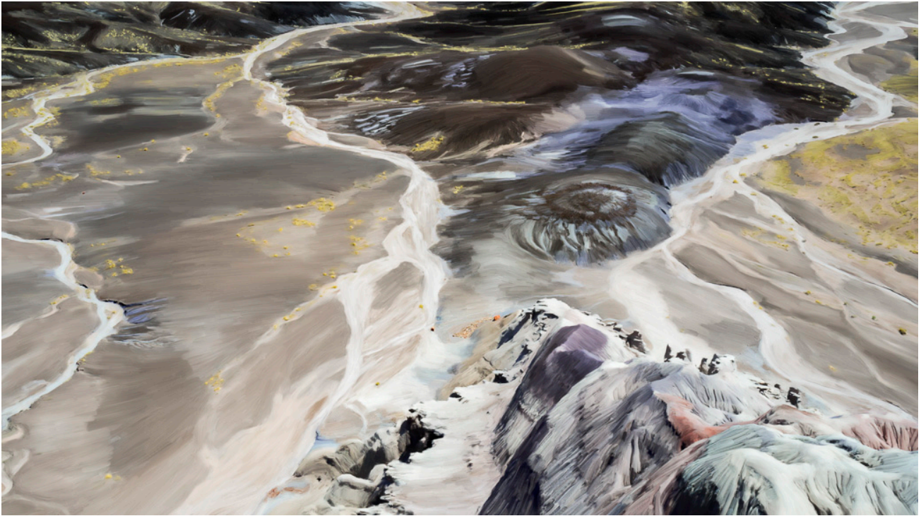
Blue Mesa. Mixed Media Image © by Ronnie McClure