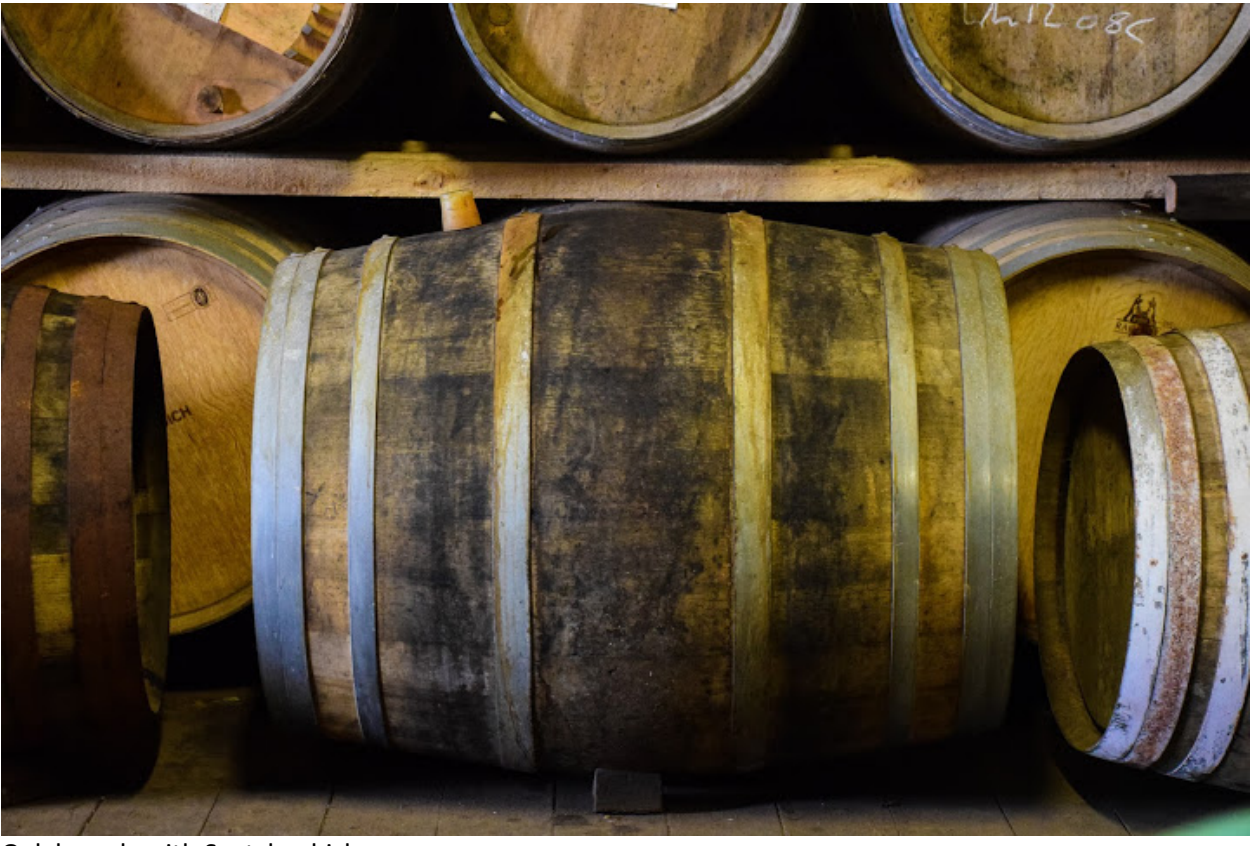
Oak barrels with Scotch whisky