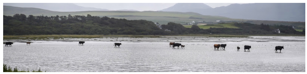
Follow the leader, Bridgend, Scotland

These photographs were taken by Seth Osher during the recent trip with his family to Scotland. They enjoyed the pictorial views of cows crossing the bay at low tide; ruins of the medieval castle and the young tree growing near its wall; boats smiling at their reflections in the harbor, and many other scenic views. Each photo shows the beauty of nature, the touches of history and Scottish people who make this solitary land a peaceful place to live.