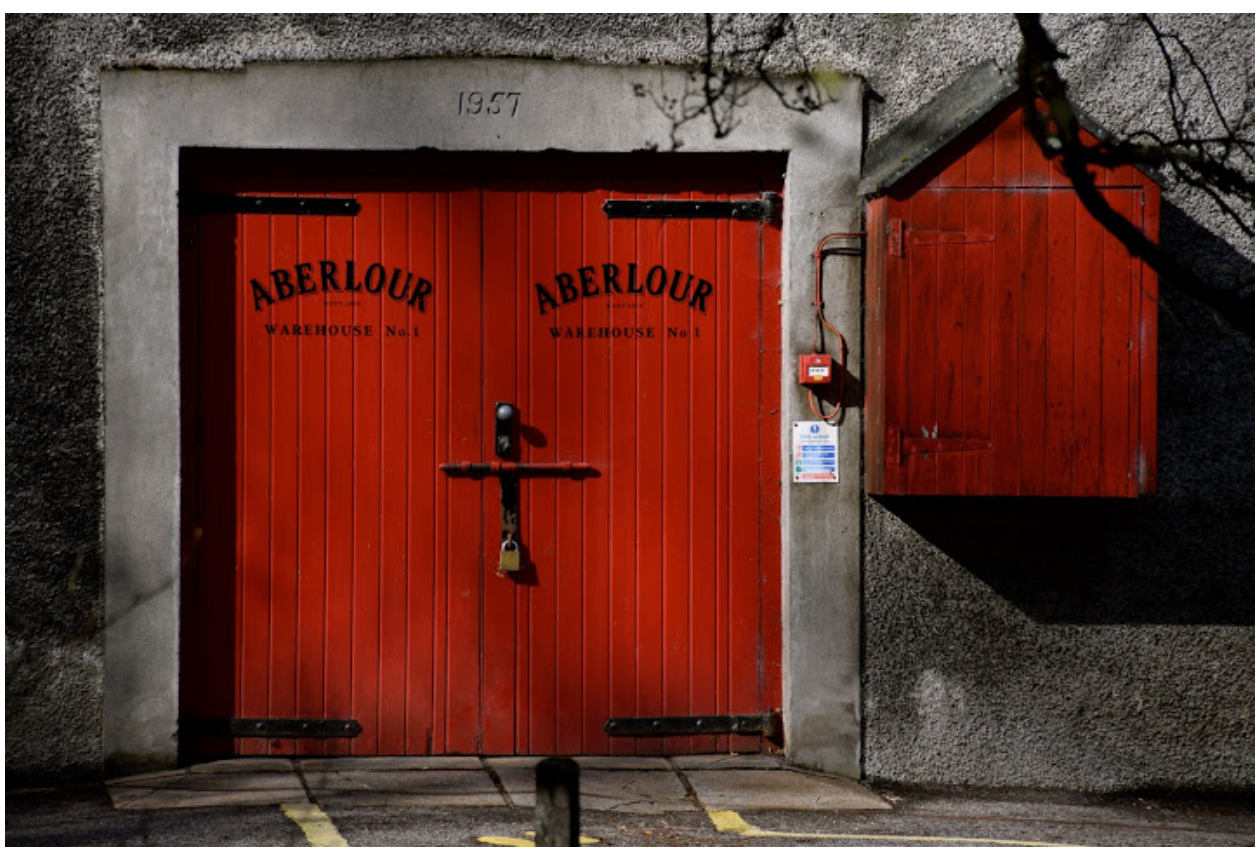
Warehouse No 1, Aberlour, Scotland