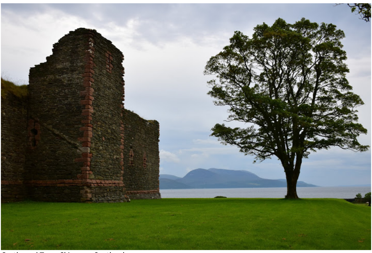
Castle and Tree, Skipness, Scotland