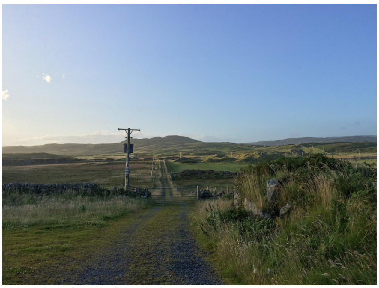
On the road to nowhere, Port Ellen, Scotland