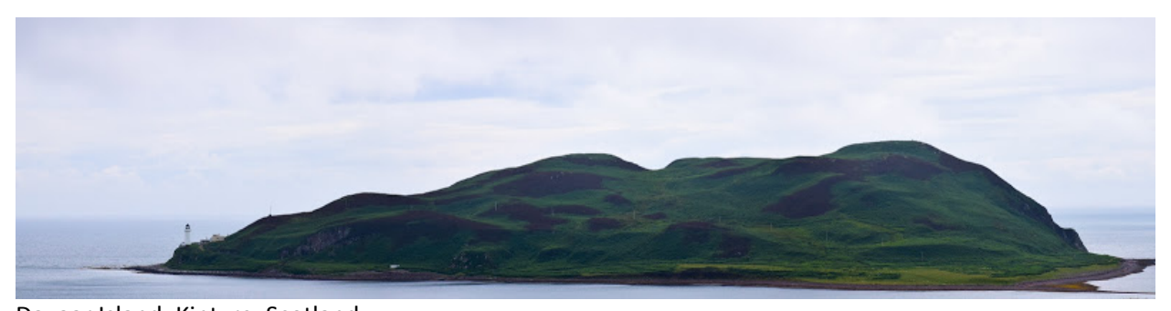
Davaar Island, Kintyre, Scotland