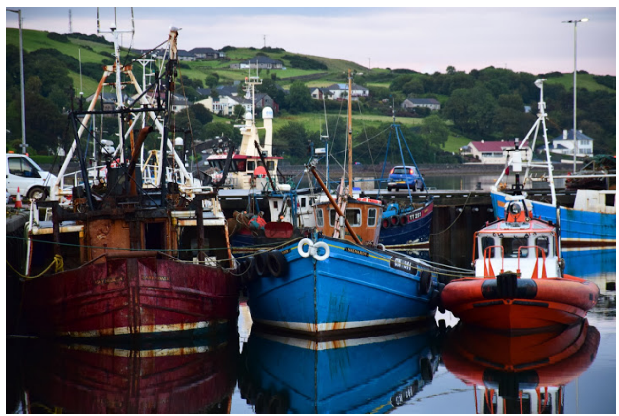
Smiling Ships, Campbeltown, Scotland