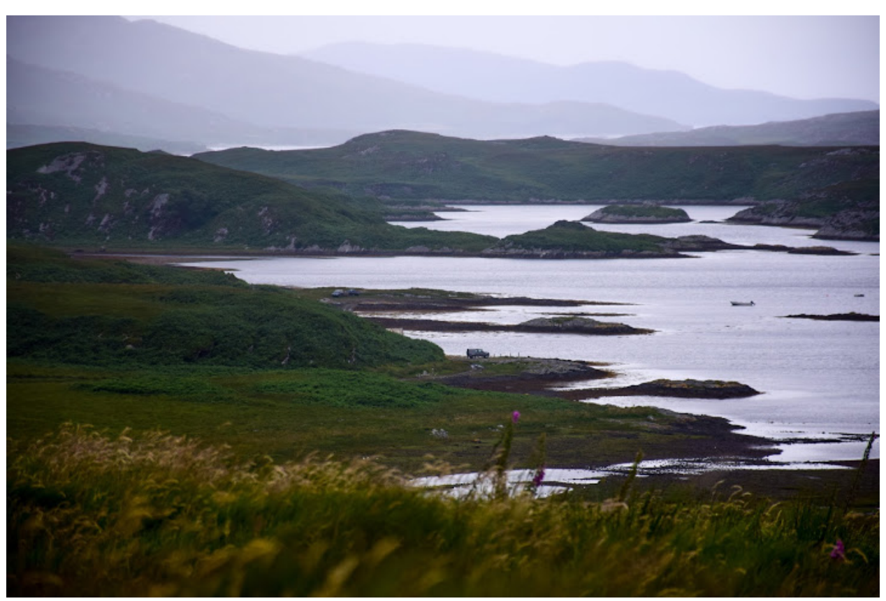
Isolation, Isle of Arran, Scotland