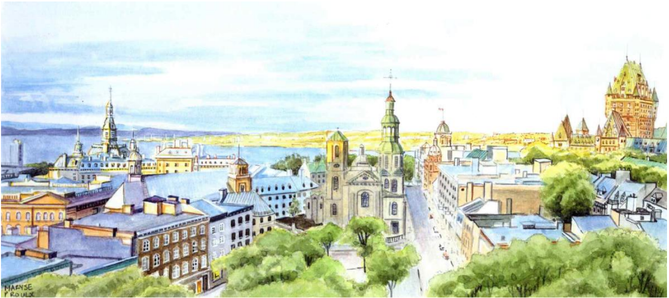
"Petit Séminaire, Basilique et Château". Black Indian ink enhanced with watercolor © 2024 by Maryse Proulx

Above: The view on The Seminary of Québec, The Cathedral-Basilica of Notre-Dame de Québec ("Our Lady of Quebec City"), and The Frontenac Castel. ■